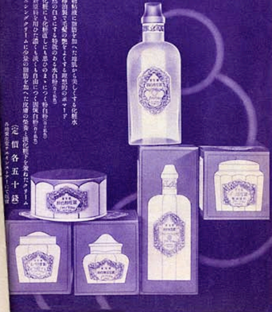
Bottles arranged in groups (left)

植物精液に酒精を加へた液から蒸して出た化粧水 植物油質で毛髪をよくと潤滑のホマード 自然の白くする特製のみろ水白粉とホマード 化粧水にも化粧直しにも使ひのよき白粉とホマード 湯洗後用ひのたたくも使ひのよき固焼白粉とホマード ペンシヤクリームに少量の酒精を加へた皮膚の保護と潤滑のクリーム