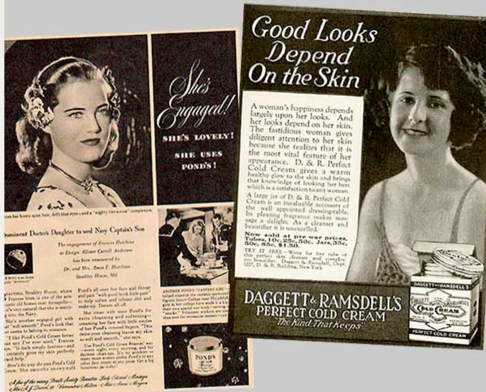
Pond's Cold Cream magazine ad, 1945

One 1922 American advertisement for Daggett & Ramsdell's Perfect Cold Cream, “an invaluable accessory of the well appointed dressing-table,” was so bold as to exclaim not only that “good looks depend on the skin,” but also that “a woman's happiness depends largely upon her looks. And her looks depend on her skin. The fastidious woman gives diligent attention to her skin because she realizes that it is the most vital feature of her appearance.”