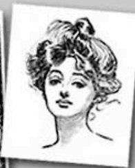
Gibson Girl, ca. 1900 by Charles Dana Gibson (near left)