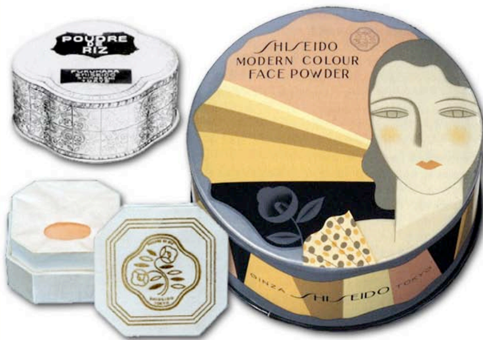
Poudre de Riz, 1917 Maeda Mitsugu, designer

The female entertainers (geisha) who worked in nearby Shinbashi and who were loyal Shiseido customers particularly liked the green and purple powder colors because they were thought to flatter the complexion under electric lighting. The powder packaging also diverged from the conventional round or cylindrical packages and used a tasteful octagonal container with the company trademark inlaid in gold that showed the nine leaves of the camellia blossom (see below). Gradually, as Japanese cosmetic practices changed over time and moved toward a greater naturalism, the traditional thick white cosmetic foundation ( o-shiroi ) ceased to be used for daily wear. 8