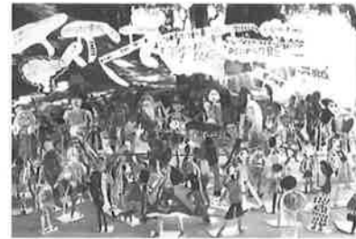
Crowd made of paper

Many Americans view schools as a way to prepare children to be effective citizens by helping them acquire certain skills, key bodies of knowledge and ideas, and habits of mind. Preschools, in particular, do not receive much support or respect in our culture. They are regarded as serving a custodial function for socialization and play, or as places to develop pre-reading, pre-writing, and pre-arithmetic skills. In Reggio, schools—preprimary schools—are seen as places to document human learning, places where children's voices can be heard, respected, and shared with the wider community. Schools are based on a network of relationships. They do not simply prepare children for adult or later life; they are seen as essential to life. Schools in Reggio are considered privileged places where culture should be reproduced and developed. They are sites of educational research that are fundamental to our understanding of how knowledge is constructed. Teachers try to enact in daily life a permanent process of research that occurs whenever