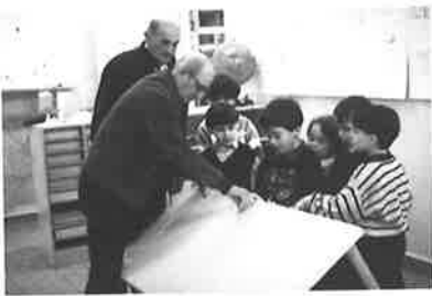
The carpenter with the children

Community members and organizations extend the learning environment beyond the walls of the classroom and connect children to the life of the community. Rather than simply bringing in community members for isolated, one-time visits, teachers and children draw on the community as additional members of the learning group who contribute to the ongoing research. When children at the Diana School decided they needed another table for their classroom, they suggested calling in a carpenter. 9 When the carpenter arrived, he explained that he needed dimensions from the children. The challenge to provide measurements for the table became the focus of investigation for a small group of children, who kept the rest of the class informed about their progress. The teachers focused on understanding and supporting the children's learning processes as they went about creating a system of measurement.