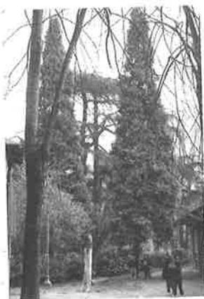
Images from a project on trees at the Diana School

the children's mattresses in the nap room.