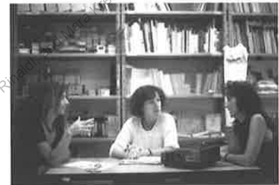
Teachers discussing documentation