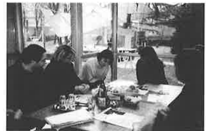
A parents' meeting

Parents too can actively participate in this culture by contributing their expertise and support and helping to document children's work in the learning groups. For example, teachers at the Villetta School noticed at the start of the year that children were spending a great deal of time experimenting and playing with water. 8 Observing the children more closely and recording their conversations, the teachers realized that the children were creating theories and hypotheses about the movement of the water. The teachers