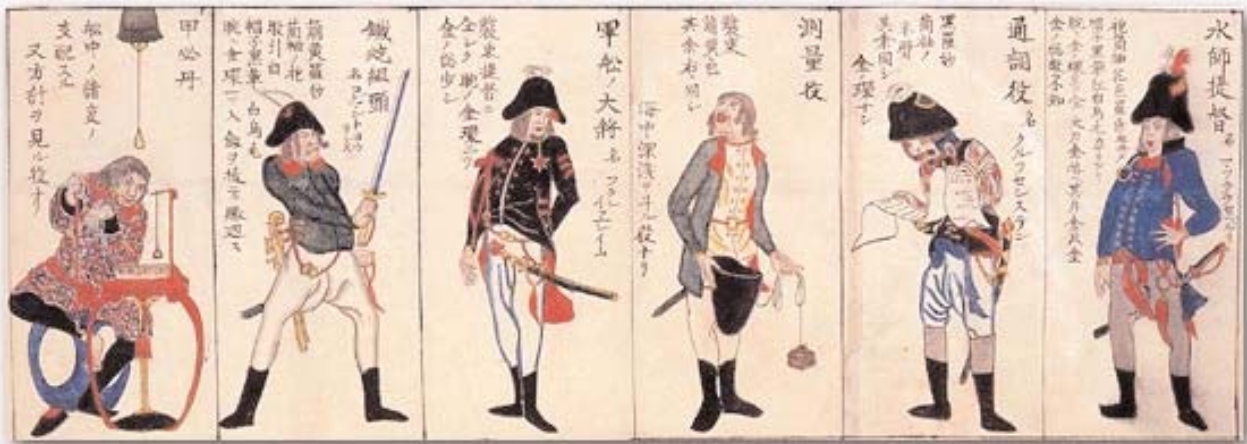
Detail from "Black Ship and Crew" ca. 1854

A particularly dramatic cast of characters accompanied one of the monstrous black ships introduced earlier, in the form of a gallery of nine individuals. In addition to Perry, the accompanying text identified them (right to left) as an interpreter, the crewman who sounded the ocean's depth, a high officer, the chief of the "rifle corps" (marines), a navigator, a marine, a musician, and a crewman from a "country of black people," usually called upon "to work in the rigging or dive in the sea." Colorful and idiosyncratic, they comprised a motley crew indeed.