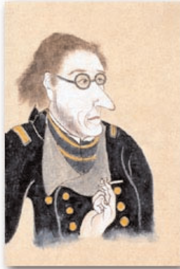
S. Wells Williams