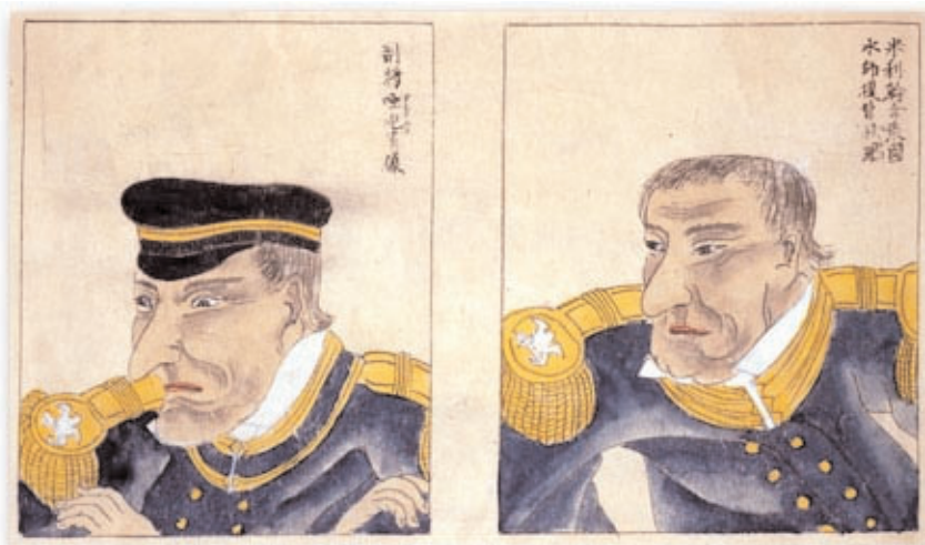
Perry (right) and Adams, ink and color on paper, 1854

As already seen in their diverse renderings of Commodore Perry, Japanese artists did not hesitate to resort to outright fantasy when drawing portraits of the foreigners. Even when they were ostensibly drawing “from life,” their attempts to capture the spirit or personality of their subjects gave a touch of caricature to the resulting portrait. We see this in an ostensibly realistic pair of paintings of Perry and Commander Henry Adams, his second-in-command, for example, as well as in anonymous woodblock portraits of a decidedly fop-pish Adams and an alarmingly sharp-visaged “American Chief of the Artillery-men.”