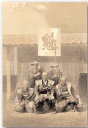
Prefect of Shimoda