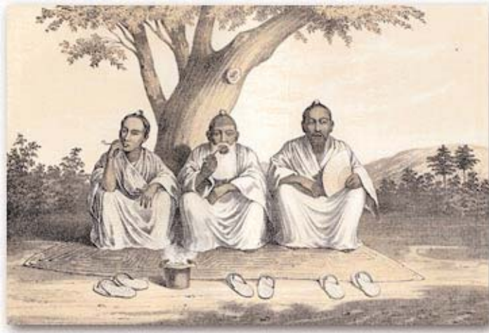
“Afternoon Gossip, Lew Chew” lithograph based on Brown’s daguerreotype

Some twenty-plus pages later, we are treated to a charming, tipped-in lithograph titled “Afternoon Gossip, Lew Chew,” depicting three men—surely these very same subjects—seated on a mat beneath a tree, smoking and seemingly at perfect peace with the world.