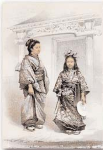
Mother and child, Shimoda