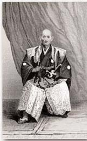
"Prince of Izu"