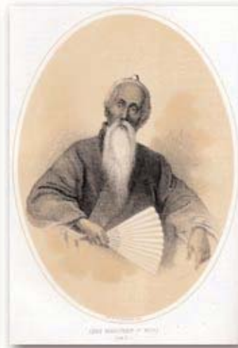
Chief magistrate, Ryukyus