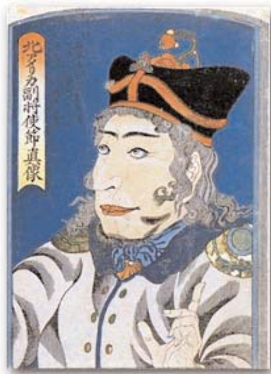
Left: “American Chief of the Artillery-men”