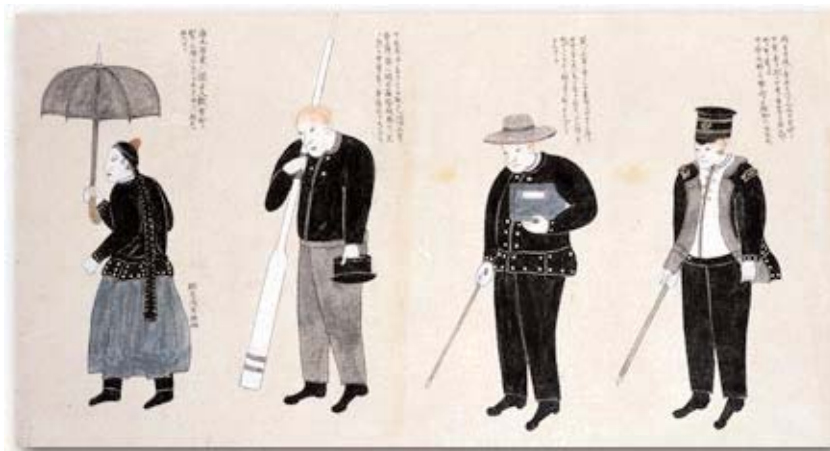
“Pictorial Scroll of Black Ships Landing at Shimoda” (detail)

Full-figure renderings of the foreigners as they were observed in Kurihama or Yokohama or Shimoda or Hakodate followed the same free style. Often these figures were lined up in a row like a droll playbill for a cast of characters who had chosen to strut their stuff on the Japanese stage.