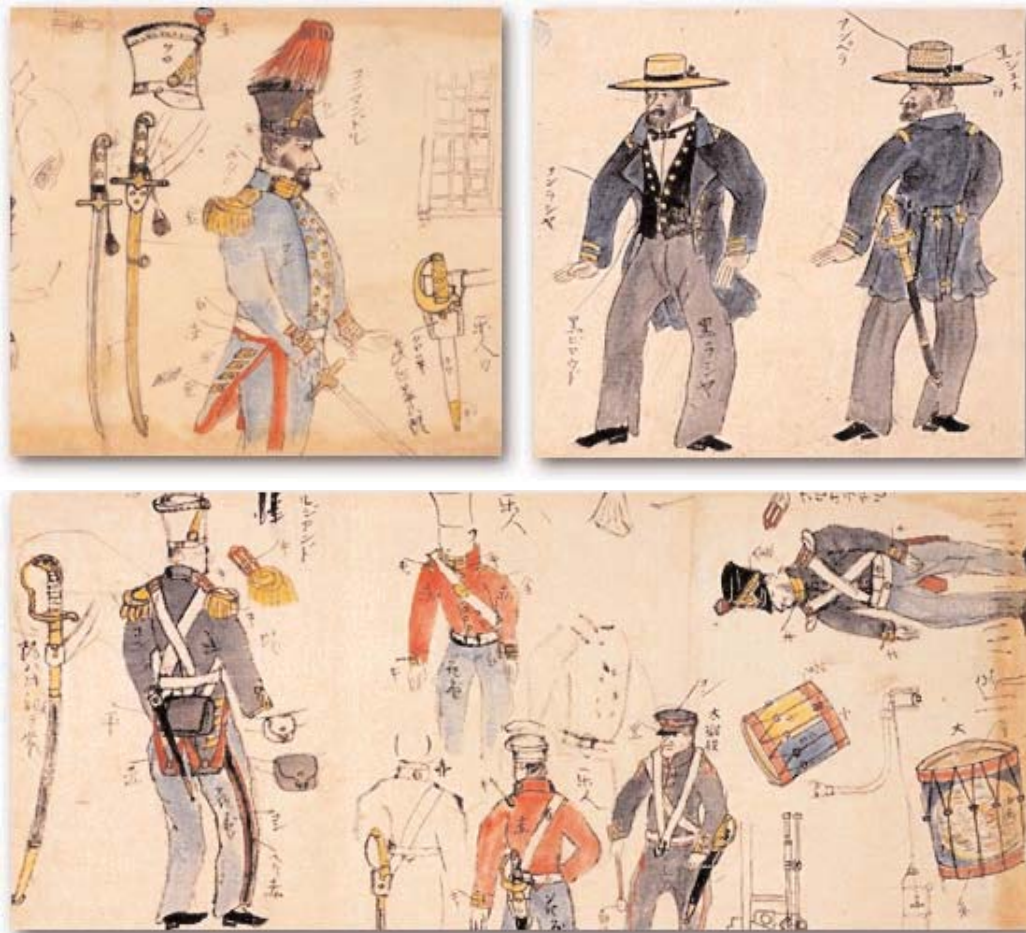
From an artist's sketchbook, 1854