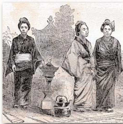
Women in Shimoda