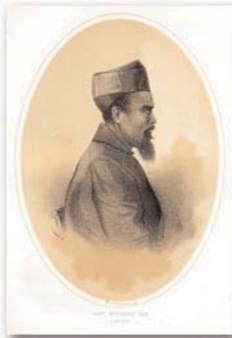
Court interpreter, Ryukyus