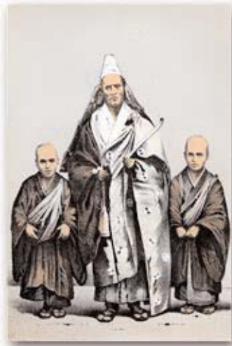
"Priest in Full Dress," Shimoda