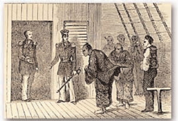
Japanese official on board the Susquehanna from the official Narrative.

Perry's strategy of simultaneously impressing and intimidating the Japanese included inviting some of their representatives to tour his flagship. This made possible a small number of on-deck and below-deck depictions of the details of the black ships.