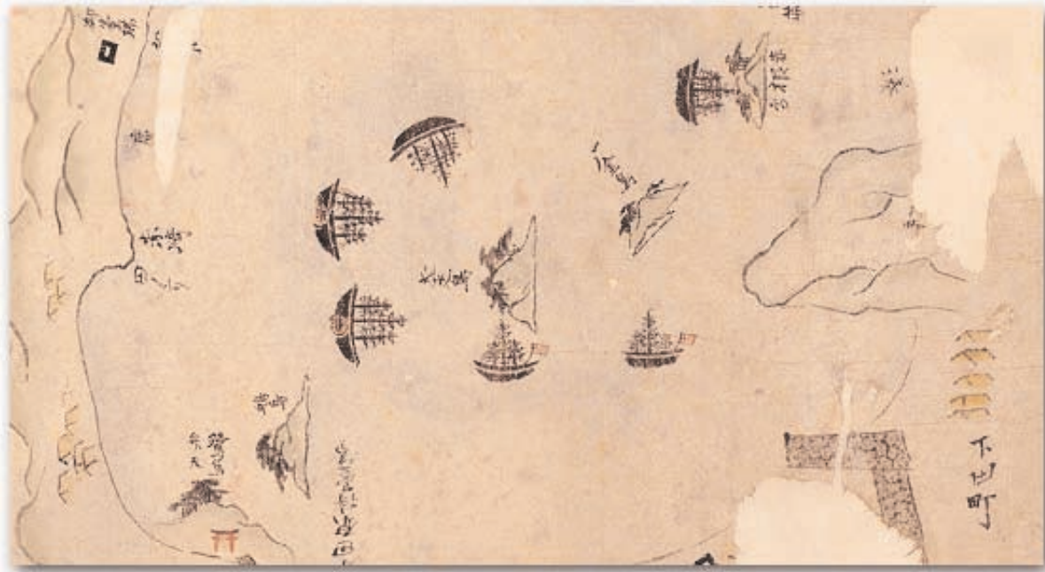
Map of the harbor at Shimoda, from the “Black Ship Scroll,” 1854

Other artists, meanwhile, rendered the foreign intrusion from afar with panoramic views of the American squadrons anchored in Japanese waters. Such graphics, done in both color and black-and-white, often were designed to convey detail concerning not only the black ships but also the surrounding terrain.