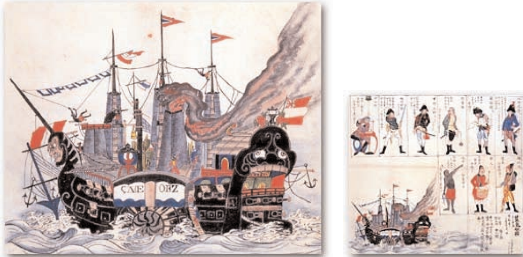
"Black Ship and Crew," watercolor on paper, ca. 1854

In a demonic sister ship that was part of a larger painted montage, many of the same features are present—and a touch more. Here smoke from the coal-burning engines is streaked with forked tongues of flame. To knowledgeable Japanese, these might well have evoked classic artistic depictions of the fires of hell and the conflagrations that consumed palaces and temples in an earlier era of civil wars.