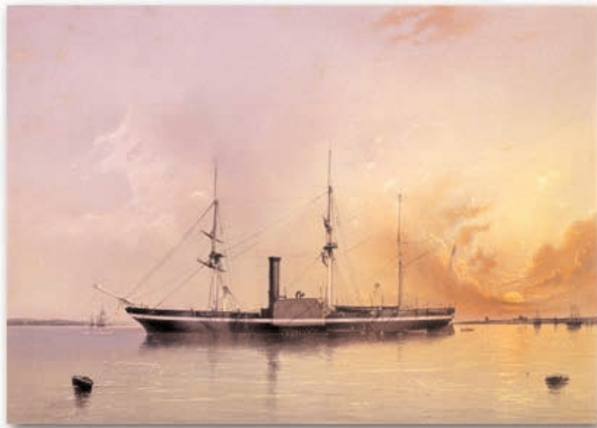
Oil painting of the Powhatan from C. B. Stuart, Naval and Mail Steamers of the United States, 1853

The Powhatan , Perry's famous flagship on the second voyage, survives in photographs, small-scale models, and—most spectacularly—the romantic frontispiece of a now classic 1853 book by Charles Beebe Stuart titled Naval and Mail Steamers of the United States . This luminescent, painterly rendering breathes romance and even mystery into this rather stolid warship through the filtered light and near-mystic ambiance associated with the "Turner school" of high-art painting (named after the British artist Joseph Turner, who died in 1851).