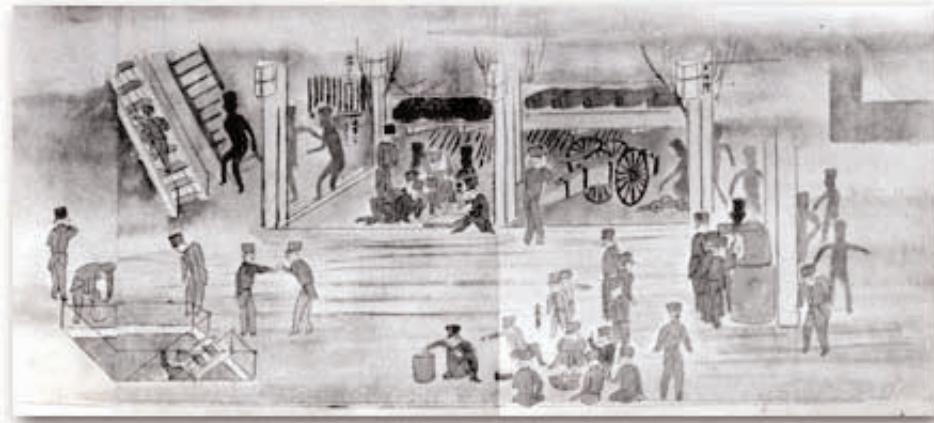
Japanese sketches from on board the Powhatan 1854