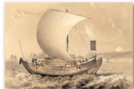
Japanese “junk” as recorded by the Perry mission in the official Narrative

Japan’s adoption of the “closed country” policy in the early-17th century involved not merely keeping foreigners out, but also keeping Japanese in. Thus, severe restrictions were placed on shipbuilding, and maritime activity was restricted to sailing small vessels in coastal waters. An illustration in the official narrative of the Perry mission depicted one of the single-sail “junks” that patrolled the waters outside Edo.