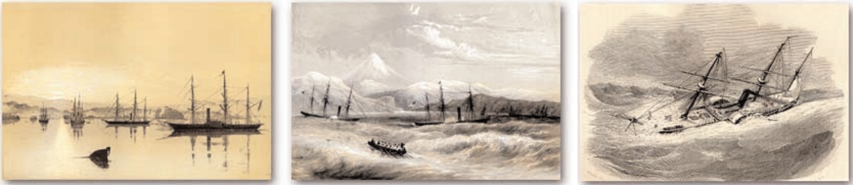
Perry's fleet at anchor and in turbulent seas, as depicted in the official Narrative

Perry's own artists captured the fleet both at rest and in turbulence, but the most provocative rendering of the black ships at sea came from a painter back home, who added a banner legend to his own imaginary artwork to remind Americans that the commodore's true mission was literally divine. Perry himself usually spoke in terms of showing the flag, opening the doors of commerce, and spreading "civilization" to a backward people.