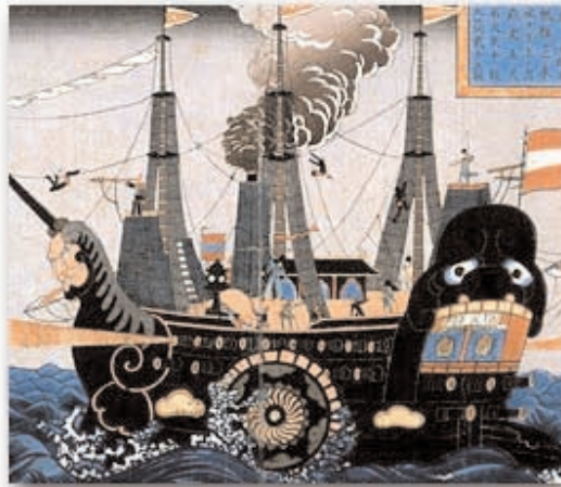
American warship, ca. 1854