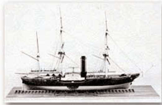
Model of the Powhatan, flagship on the second voyage