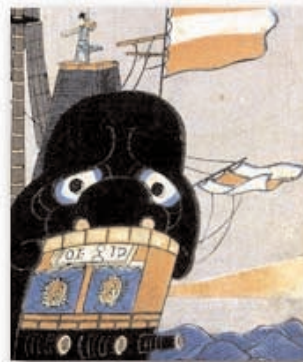
American warship, woodblock print ca. 1854 Nagasaki Prefecture