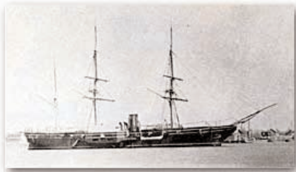
Photograph of the Powhatan, which remained in service until 1887