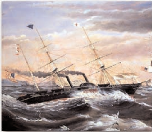
“Carrying the ‘Gospel of God’ to the Heathen”