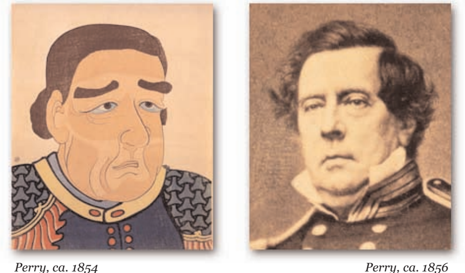
1 erry, cu. 1054