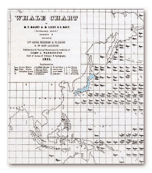
Whale Chart, Japan in blue (detail, color added) by M.F. Maury, US Navy, 1851