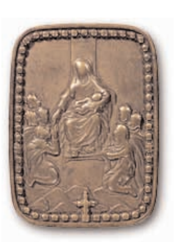
Fumie of Virgin Mary with Christ child

The rationale behind the draconian seclusion policy was both strategic and ideological. The foreign powers, not unreasonably, were seen as posing a potential military threat to Japan; and it was feared, again not unreasonably, that devotion to the Christian Lord might undermine absolute loyalty to the feudal lords who ruled the land.