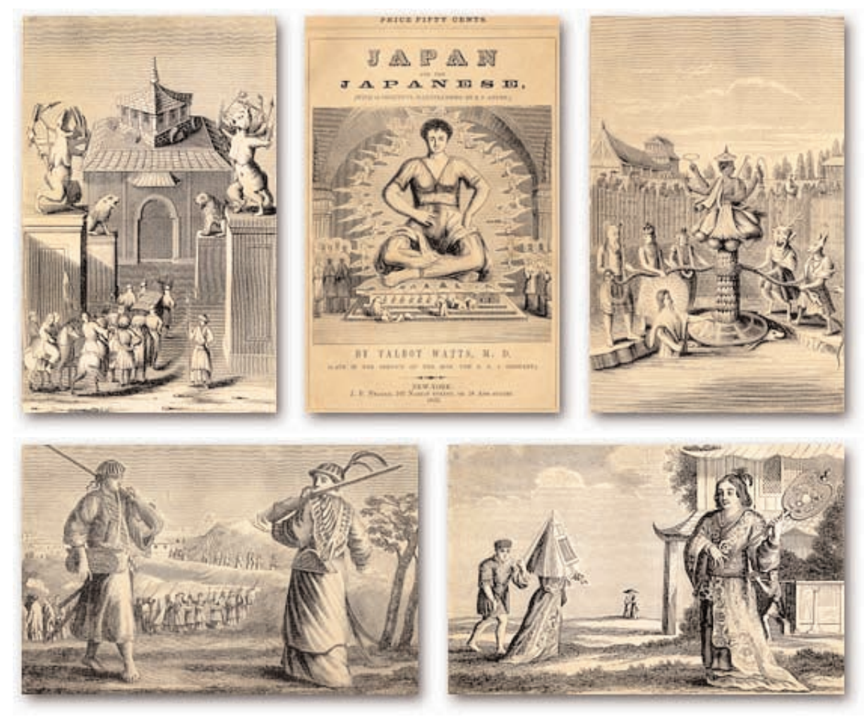
Illustrations in Japan and the Japanese (1852) included the worshipping of idols, "Habit of the Japanese Soldiers," and "A Japanese Lady of Quality"

In Japan and the Japanese, a small book published in America in 1852 as a send-off to the Perry expedition, a former employee of the British East India Company paired synopses of prior writings with a selection of illustrations that revealed how odd and exotic the littleknown heathen still remained in the imagination of Westerners. These thoroughly fanciful graphics conjured up a world of bizarre religious icons commingled with sturdy men and women wearing Chinese-style robes, holding large and stiff fan-shaped implements, even promenading with folded umbrella-like tents draped over their heads and carried from behind by an attendant.