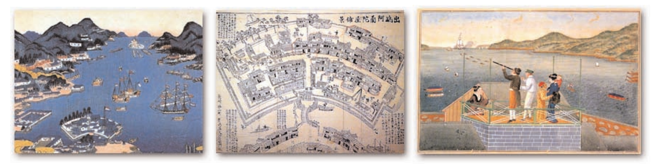
The "fan-shaped" island of Dejima in Nagasaki harbor, where the Dutch were permitted to maintain an enclave during the period of seclusion

The most notable small exception to the seclusion policy was the continued presence of a Dutch mission confined to Dejima, a tiny, fan-shaped, artificial island in the harbor at Nagasaki. Through Dejima and the Dutch, the now isolated Japanese maintained a small window on developments in the outside world.