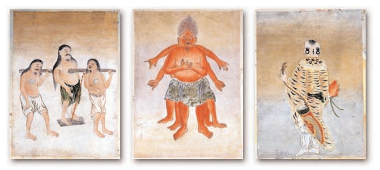
"People of Forty-two Lands" (details), ca. 1720

An 18th-century scroll titled "People of Forty-two Lands," for example, played to such imagination with illustrations of figures with multiple arms and legs, people with huge holes running through their upper bodies, semi-human creatures feathered head to toe like birds, and so on.